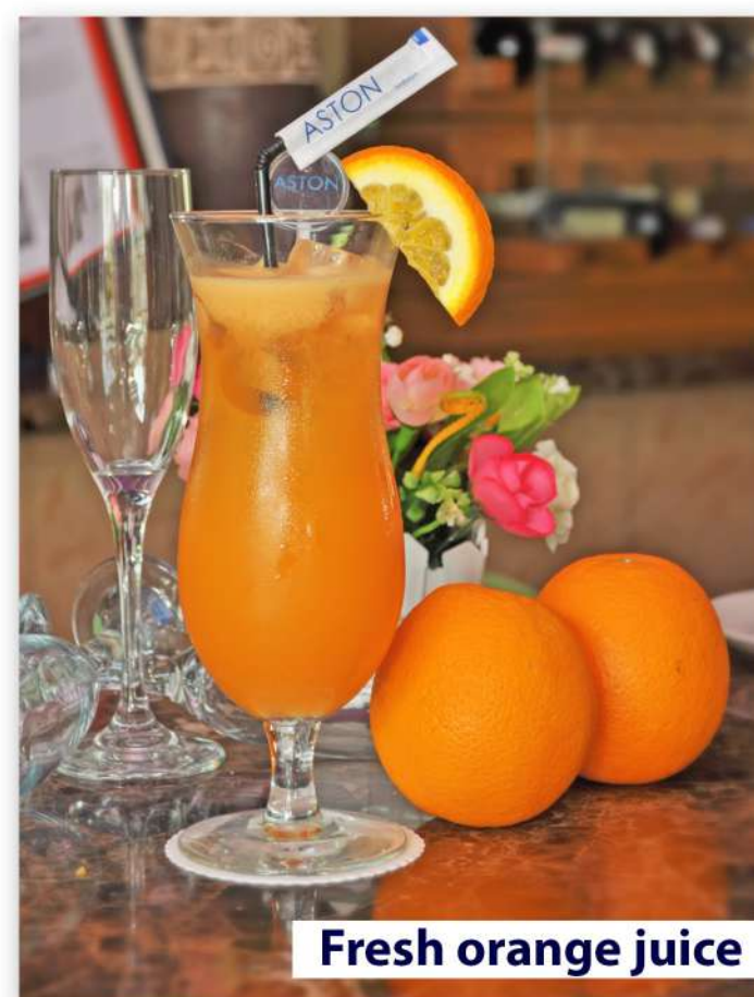
Fresh orange juice

Orange, guava, apple, soursop, pineapple, honeydew, kiwi, watermelon, strawberry, papaya, carrot, star fruit and tomato