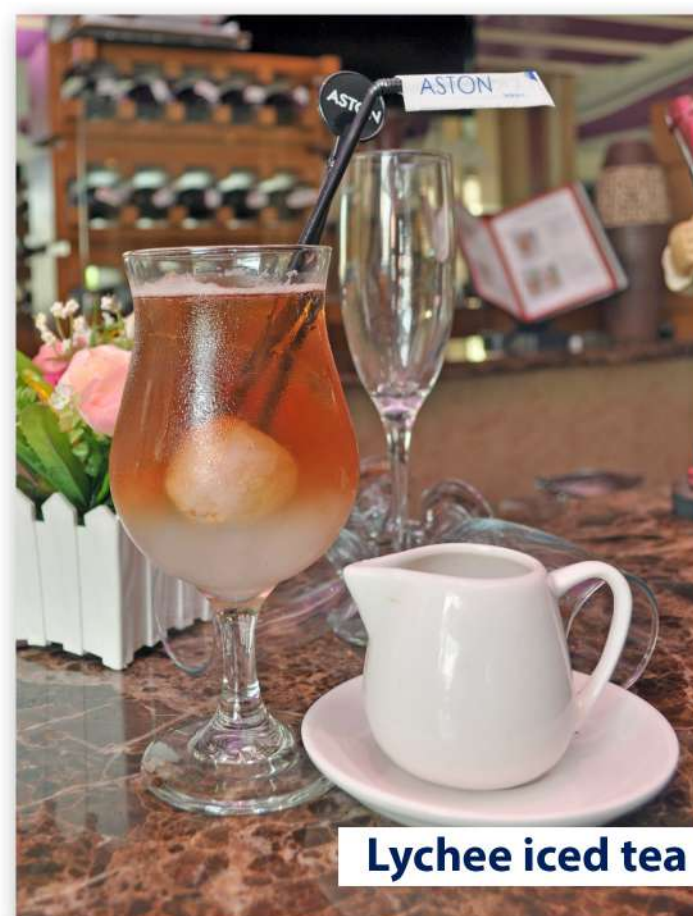
Lychee iced tea