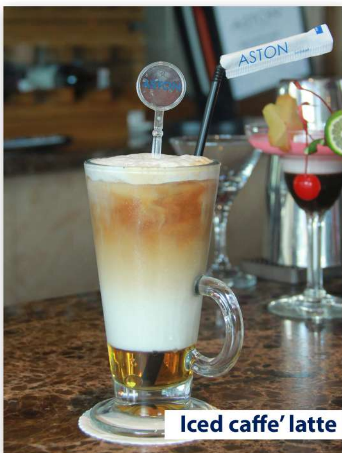
Iced caffe' latte

Price are subject to 10% service charge and 11% tax