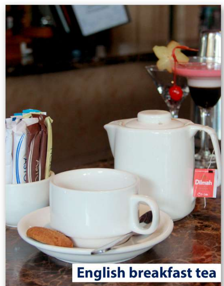
English breakfast tea

Price are subject to 10% service charge and 11% tax