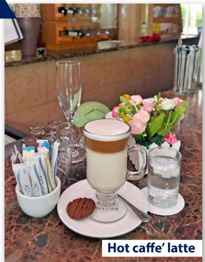
Hot caffe' latte

(Single espresso with fresh milk chocolate)