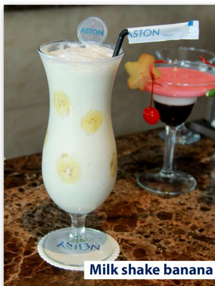
Milk shake banana